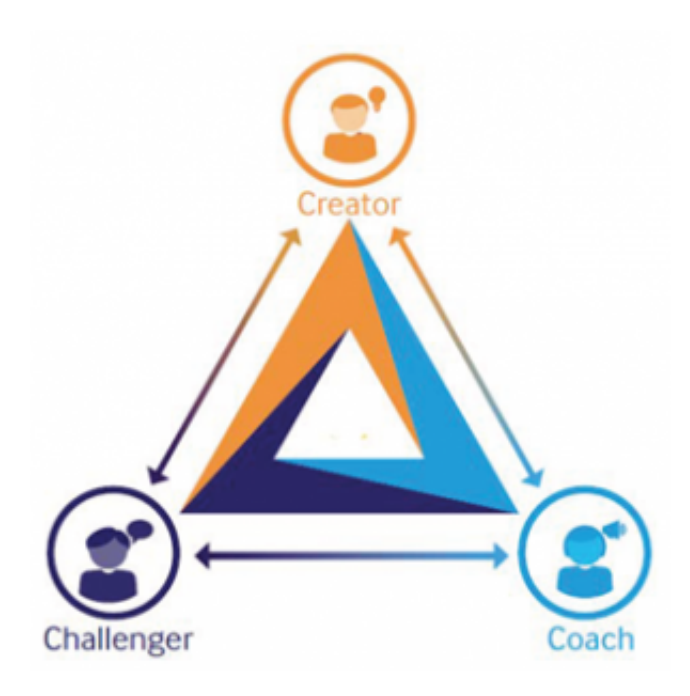
The Empowerment Dynamic