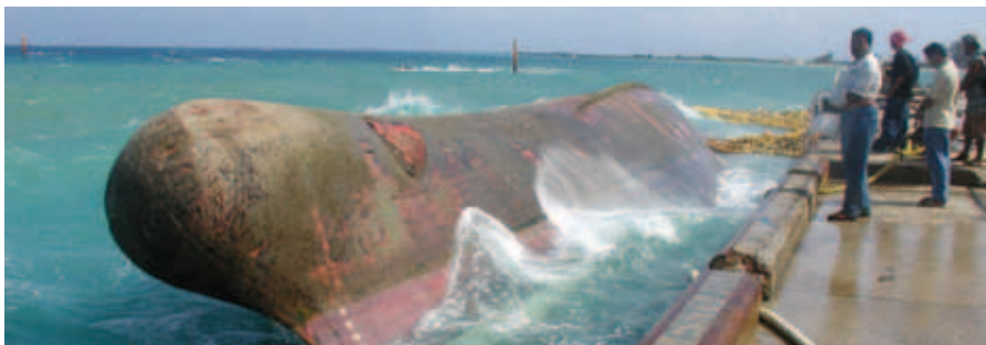
Figure 3: Capsized fishing boat