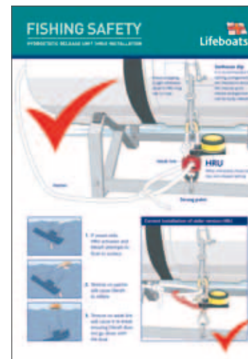
Figure 11: RNLI poster on Hydrostatic Release Units (HRU)

It is important that extinguishers are fit for purpose. Extinguishers are colour coded according to the type of fire they are suitable for and it is essential that crew members are given training on the categories as below: