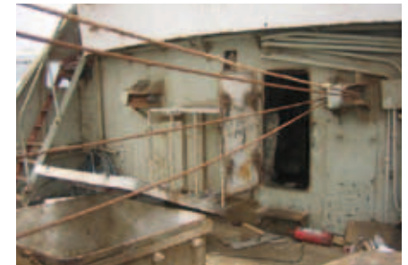
Figure 6: Poorly maintained fire extinguisher not in correct location