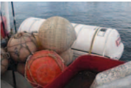
Figure 1: Obstructed life raft

This publication does not seek to fully inform the skipper and their crews about all on board safety requirements (including the safety aspects involved with different methods of fishing). Instead it hopes to highlight areas that, from the Club's experience, contribute to crew members becoming more safety aware, as well as assisting members of crew to recognise the dangers for themselves.