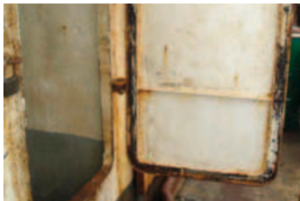
Figure 2: Poorly maintained access rubbers