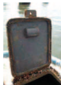
Figure 8: Hatch without a locking pin

It is well understood that fishing vessels, during operations at sea, are constantly working with very few rest periods so the possibility to undertake maintenance during these periods may be unlikely. Maintenance must be performed and therefore it is the skipper's responsibility to ensure this is carried out.