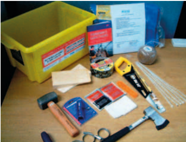
Figure 13: Typical Damage Control Kit

Many incidents and vessel losses are the results of flooding. Fishermen are taught little about preventing their vessels from sinking once water ingress begins. Preventing this from happening could be achieved through thorough and regular maintenance, but saving the vessel during a flooding incident could be achieved by having knowledge of damage control and the right equipment on board (i.e. Damage Control Kit - Figure 13 ).