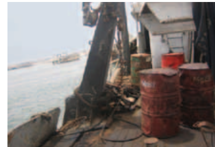
Figure 5: Working deck with many obstructions and dangers