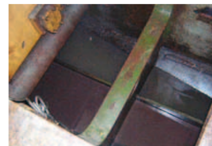
Figure 9: Bilges containing water