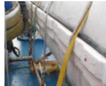
Figure 10: Incorrectly stowed life raft