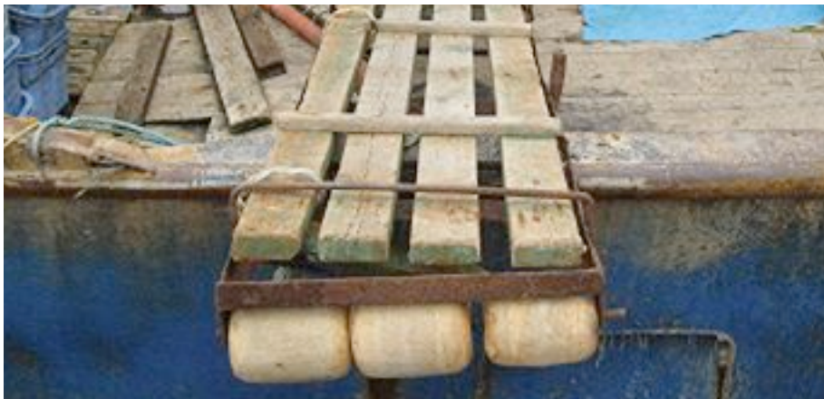
Figures 2 and 3: Means of access incorrectly rigged

5 Safety Net – If it is applicable and practicable a safety net is to be fitted under every part of the access ladder or gangway extending on both sides and kept taut. The net must not be secured to any fixed point on the quay. Figures 2 and 3 show gangways incorrectly rigged therefore increasing the risk of incidents. Figure 4 shows a correctly rigged gangway, with access ladder, security point, security notices and the permanent presence of a watch keeper.