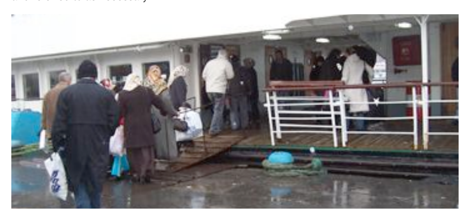
Figure 14: The area between the gangway and vessel's railing left unguarded

Responsibilities of the crew members should be included in the vessel's working procedures and referred to as necessary.