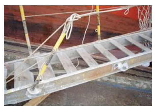
Figure 8: Gangway in need of maintenance