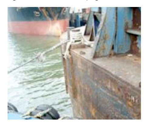
Figure 10: Incorrect access between two vessels