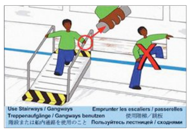
Figure 13: Illustration taken from the passenger safety card issued by the Club

The Club has also issued a passenger safety card (Figure 13) which highlights the need for using the gangway.