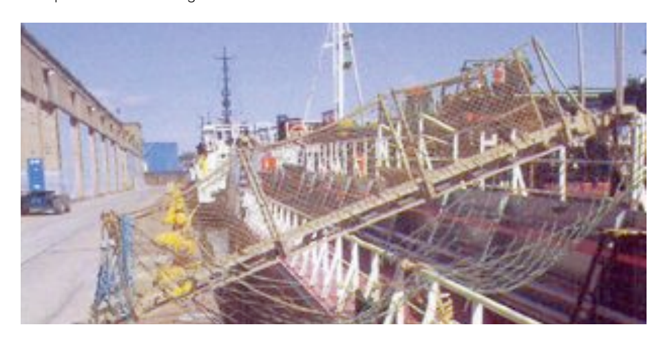
Figure 1: A typical set up of a gangway