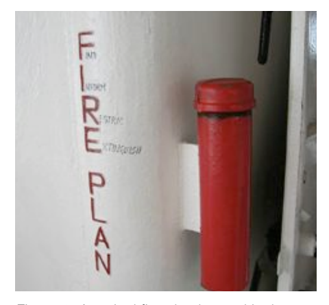
Figure 6: A typical fire plan located in the vicinity of the vessel's access

When assembling an access it is not only the vessel's equipment, access and procedures that need to be assessed and followed but also those ashore. It should be ensured, as far as possible, that the end of the ladder being located on the quay is placed in an unobstructed area clear of debris and oil patches and is away from impending dangers such as lorries / cranes for cargo work and cargo being loaded / discharged.