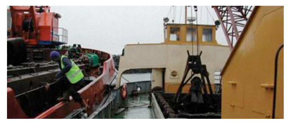
Figure 9: A crew member leaping from one vessel to another as no correct means of access is rigged

It should be noted that when vessels are double banked (i.e moored alongside each other) the vessel which is outboard will normally set up the equipment to the other vessel although, in cases where the freeboard differs greatly, access should be provided by the vessel with the greater freeboard.