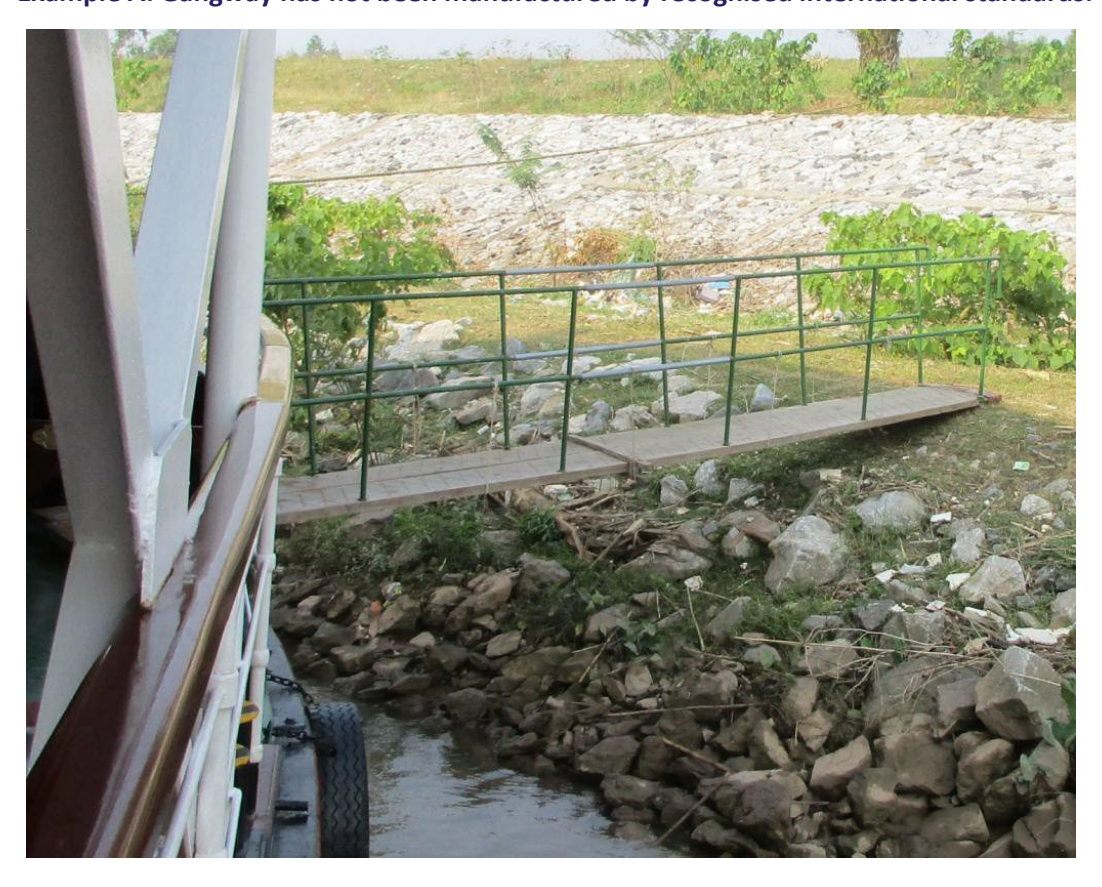
Example A: Gangway has not been manufactured by recognised international standards.